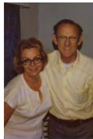
1979 with Dad