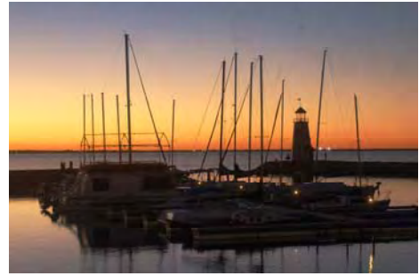
Sunset over Lake Hefner – Oklahoma City