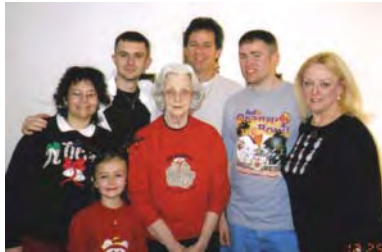
The Whole Family

Christmas 2006 was better than we could have ever imagined it would be, exchanging gifts, eating barbecue, and playing ping-pong at Mom's house. Who'd have dreamed she'd be cooking our Christmas dinner a year after her lung cancer diagnosis? We entered 2007 thankful for another Christmas with her.