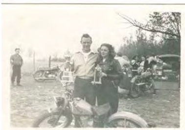
In 1952 with Dad – and yes, SHE won that Motorcycle trophy herself!