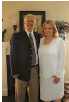
June 22, 2007